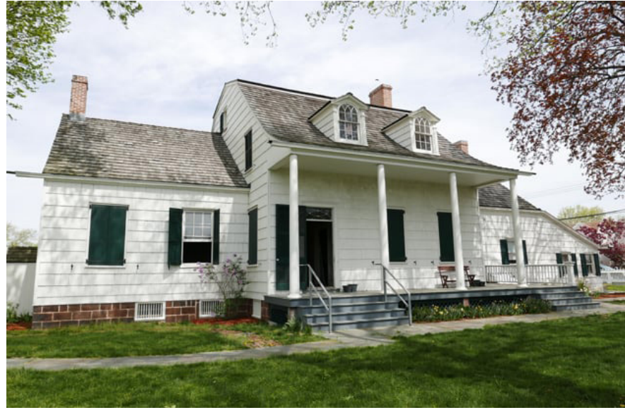
The Hendrick I. Lott House in Marine Park, Brooklyn

As a final reason, the SATs, ACTs, and SHSATs are auguries of successful futures and attendance at prestigious colleges. These standardized tests often foreshadow who will attend Career and Technical Education programs or seek professions requiring particular certificates or degrees. According to both the Center of Analysis of Longitudinal Data in Education Research and the American Institutes for Research, students scoring high on standardized tests at the end of high school typically earned over 10% more annually. The same sources also noted radical correlations between these tests and high employment rates and education success. Therefore, proponents of abolishing SHSATs, ACTs, and SATs do have credible claims to their reasoning. Yet in light of all the provided evidence, and an abundance more, it is clear that these exams are implemented for the benefit of education as a whole. They ensure a successful life in high school and beyond, signifying an improvement in students, and they create a fair and prevalent grading system that is nearly faultless as well as unbiased. Hence, once more, I believe that the existence of such standardized tests has advantages that extend far beyond the harms.