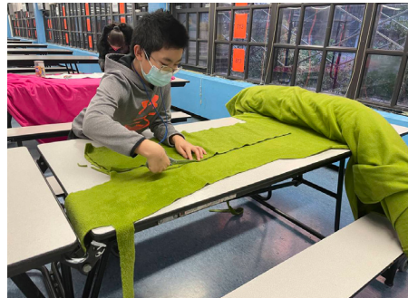
Students learn to operate a sewing machine and create patterns in NIA's sewing club.